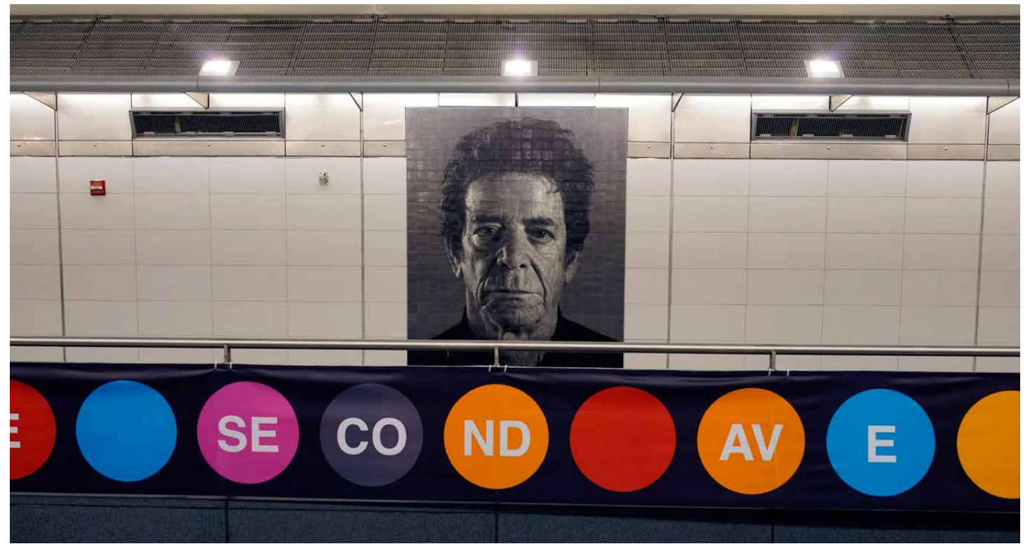
Chuck Close - Subway Figures, 2017 (installation view of Lou Reed portrait). Ceramic tile with hand-painted glaze; 9 x 7 ft; photo by Donald Farnsworth.

Magnolia Editions is pleased to announce the studio's involvement in what has been billed as the "largest public art installation in New York history," when Subway Figures (2017) by Chuck Close and works by three other artists were permanently installed in New York City's Second Avenue subway expansion, opening January 1st, 2017. Magnolia Editions fabricated ceramic tile portraits of Lou Reed and Philip Glass from Close's Subway Figures ; over the past eight years, the studio also developed the technique used to fabricate these two portraits.