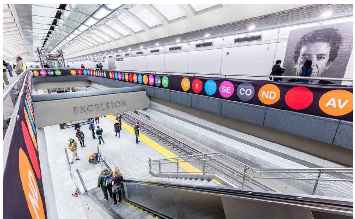
Installation view of ceramic portrait of Lou Reed at the Second Ave-86th St Station, from Chuck Close's Subway Figures.